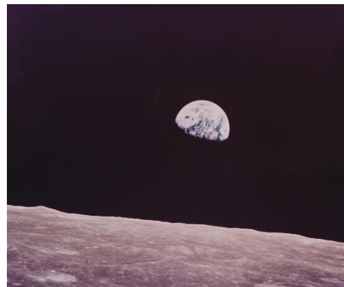
First Earthrise seen by human eyes, William Anders, Apollo 8, December 1968, Sold for £9,920 [Lot 155]

The From the Earth to the Moon: Vintage NASA Photographs was held at Dreweatts & Bloomsbury Auctions' saleroom in London's Mayfair on Thursday 26 th February 2015. The catalogue and results are available to view and download online at www.bloomsburyauctions.com