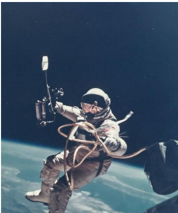
The First US Spacewalk , captured by James McDivitt – Ed White's EVA over New Mexico, Gemini 4, 3 June 1965, Sold for £2,728 [Lot 25]

London – A one-of-a-kind collection of vintage NASA photographs, including the first photograph from space and the first 'space selfie' sold at Bloomsbury Auctions' buzzing London saleroom on Thursday 26 th February. High demand from over 300 bidders across the globe saw prices soaring past their pre-sale estimates.