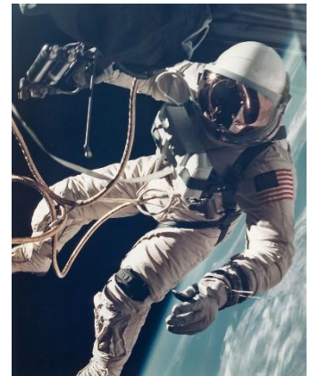
The First US Spacewalk , captured by James McDivitt – Ed White's EVA over New Mexico, Gemini 4, 3 June 1965, Sold for £10,540 [Lot 293]