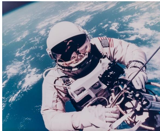
The First US Spacewalk , captured by James McDivitt – Ed White's EVA over Hawaii, Gemini 4, 3 June 1965 Sold for £13,640 [Lot 294]