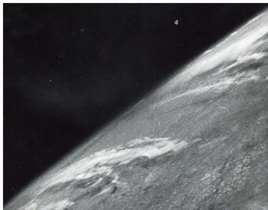
The first photograph from space, 24 October 1946 Sold for £1,736 [Lot 2]