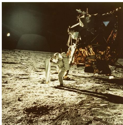
The first photograph of a man standing on the surface of another world, Apollo 11, July 1969 Sold for £3,472 [Lot 250]