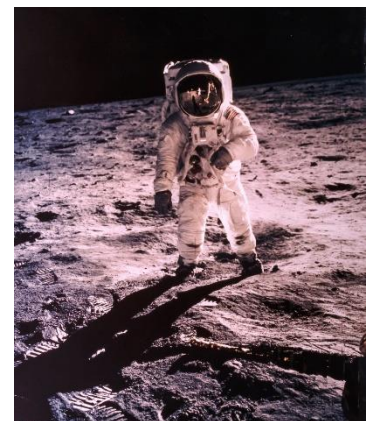
Portrait of Buzz Aldrin with photographer Neil Armstrong reflected in his gold-plated visor, Apollo 11, July 1969, Sold for £11,160 [Lot 325]