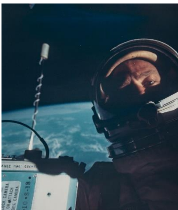
The first 'Space Selfie', taken by Buzz Aldrin, Gemini 12, November 1966, Sold for £5,952 [Lot 80]